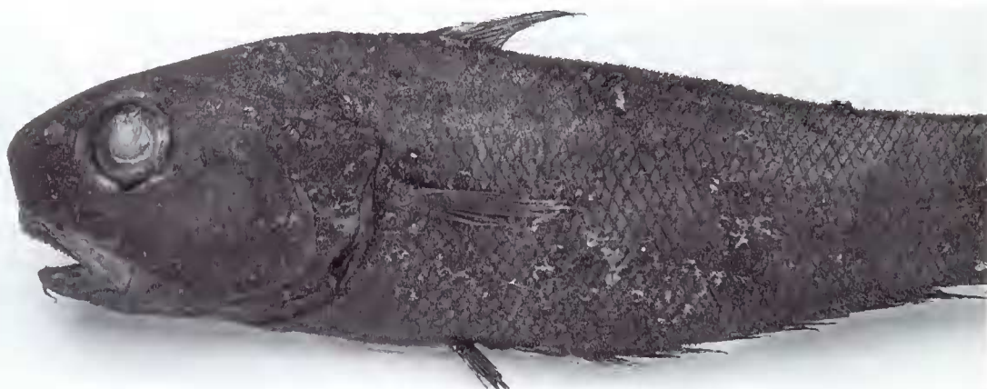
Figure 1. Holotype of Trachonurus gagates, AMS I.24059-009, 70.2 mm HL, 430+ mm TL, from off New South Wales, Australia, in 978 m.